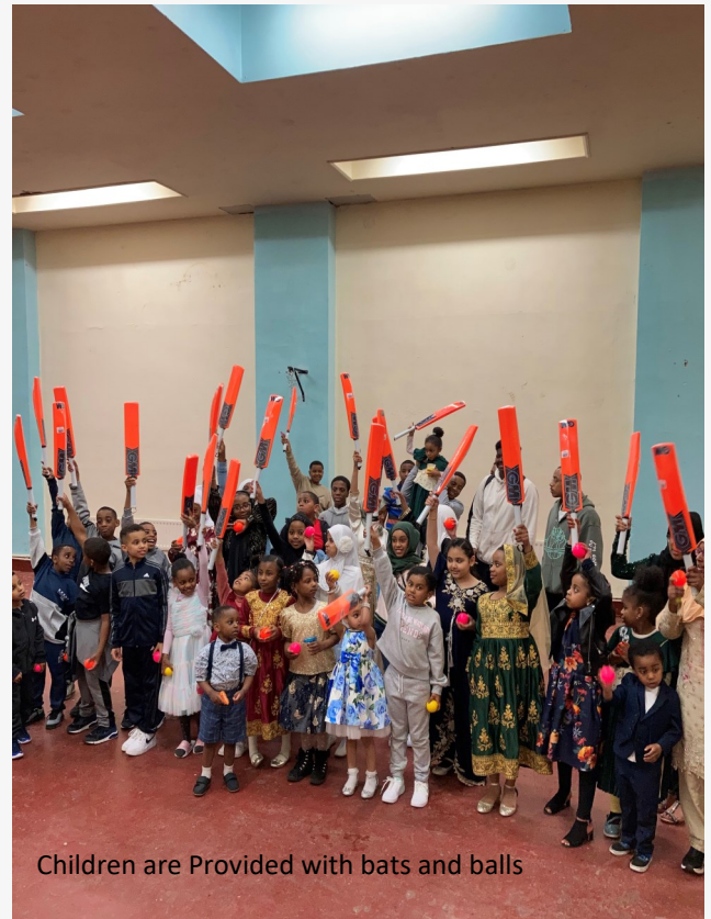
Children are Provided with bats and balls

Funded by the Charitable Youth Trust, the sessions are run by Yorkshire Cricket affiliated coaches. Children do not need to sign-up, register or pay to attend the sessions; they are free to anyone who wishes to participate.