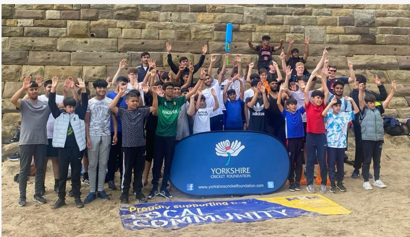
Queen's Baton Relay

In July Pop Up Cricket headed to Scarborough, we partnered up with Scarborough council to bring Pop Up Cricket to the beach. On the 13th of July Scarborough took part in the Queen's baton relay ahead of the Commonwealth Games. We thought that Pop Up Cricket would be a great opportunity to get children playing on the beach as the Baton comes through. The day went really well with lots of children taking part through out the day.